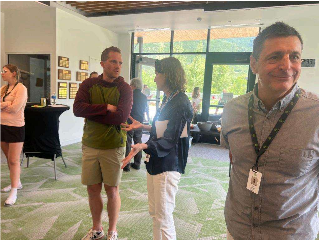
City employees discuss the Burlingame early childhood education project with the community.