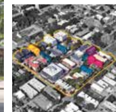
Renderings: SAR+ Architects