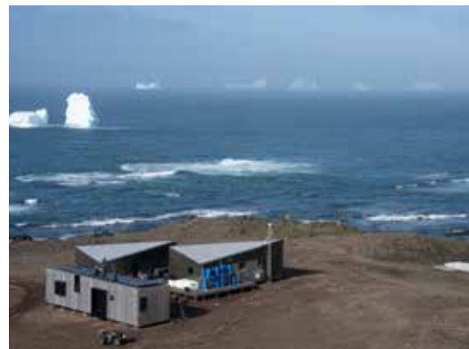
Holt Waters Field Camp