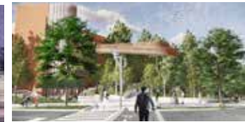
Renderings: Kent Freed