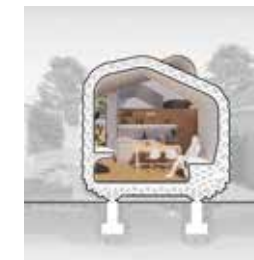
Pitch House Building System