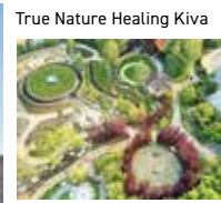
True Nature Healing Kiva