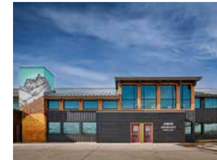
Gunnison-Crested Butte Regional Airport