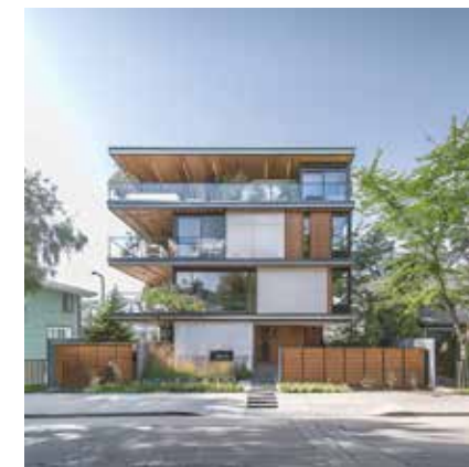
Point Access Blocks