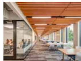
Engineering Center North Wing Renovation